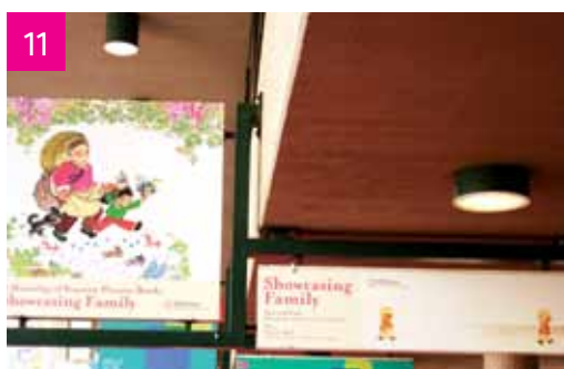
Main entrance BCBF