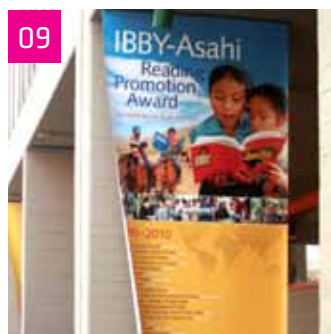
Main entrance BCBF