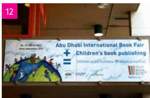
Main entrance BCBF