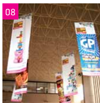
Main entrance BCBF